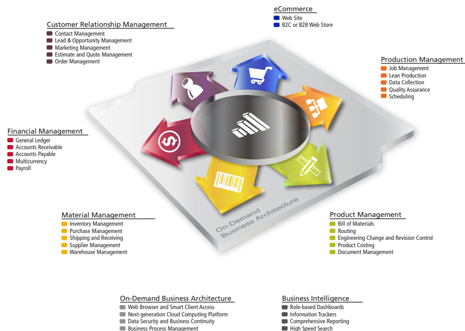
Figure 3: Epicor ERP

Copyright © 2014 Epicor Software Corporation or subsidiary or affiliate thereof. All rights reserved.