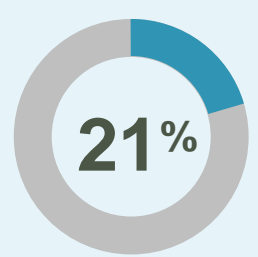
of companies have deployed a dedicated quality management system<sup>1</sup>

In spite of all the technology that's available, many quality managers seem reluctant to move forward with dedicated quality management systems (QMS). Instead, they rely on sub-optimal systems that may well slow their company's progress and increase risk.