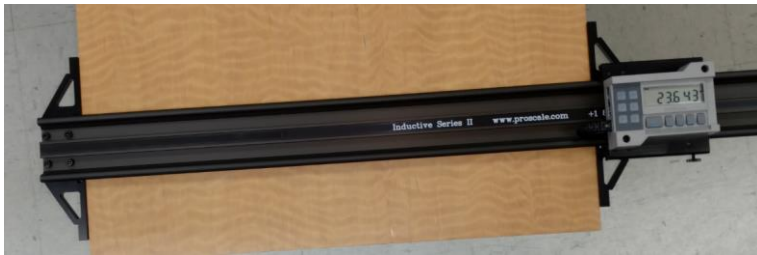
Measuring a Panel's width (Length measurements use same process)