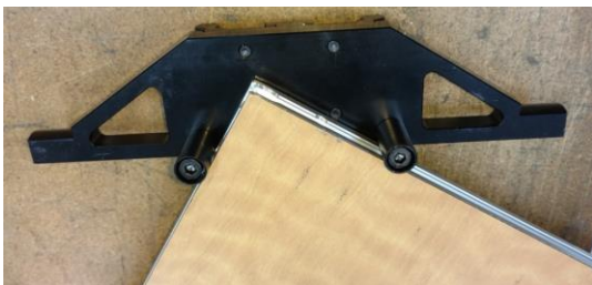
Comparing diagonal measurements