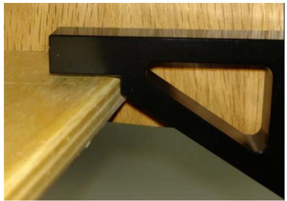
Measuring inside a frame