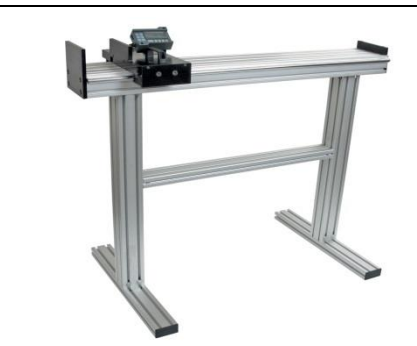
Leg Kit : makes ProTable a free-standing system. Add casters to make it mobile.

Accuracy is guaranteed within +/-.003 inches, and the system has built-in temperature monitoring and thermal compensation . Adjustable feet are included for easy leveling. Numerous options exist for different measurement applications/industries (see below).