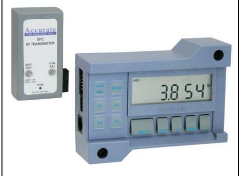
Transmit measurements wirelessly to a remote computer using our ProRF-SPC Transmitter/Receiver System .