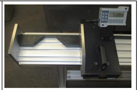
Custom inserts allow measurement of SHORT leg on mitered parts plus overall length measurement. Changeover time is less than 1 second .