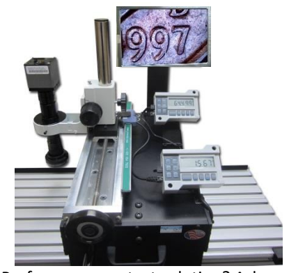
Prefer a non-contact solution? Ask about one of our Optical solutions . (Shown with 2 measurement axes .)