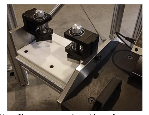
Wear Sheets protect the table surface. Corner-to-Corner fixtures also shown. Changeover time to length measurement is <4 seconds.