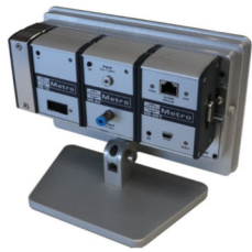
Rear Mounted Modules

ports can be added with DIN rail attached modules for automated process control. Advanced capability includes a simple programming language for highly customized applications. The W400 can either be bench top or panel mounted. Its enclosure is machined in a solid aluminum block and offers an incomparable robustness, even when used in the most severe industrial environments. The W400 can be used on simple manual applications supervised by an operator, or on fully automated machines. The W400 packs a lot of power, while maintaining ease of use.