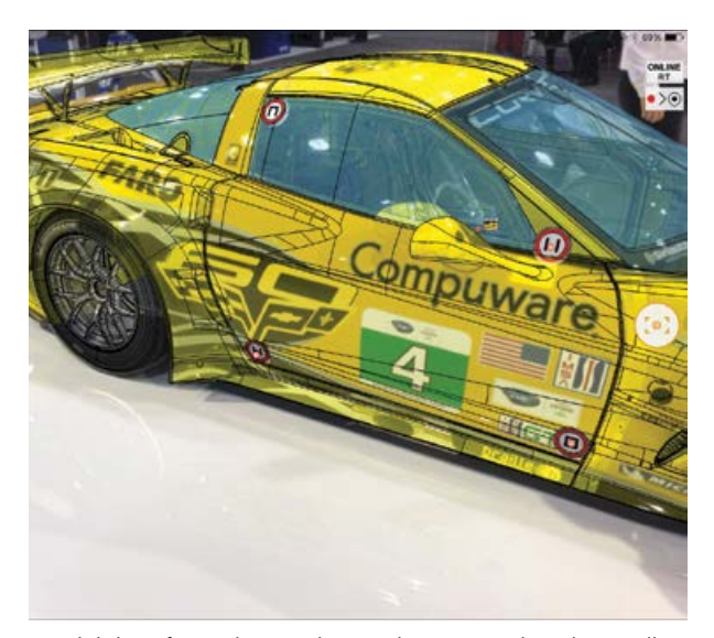
Availability of complex 3D data and Augmented Reality in all working environments, allows for quality assurance processes, wherever and whenever.

QR (Quick Response) code scanning also speeds up the process. The operator can open the 3D