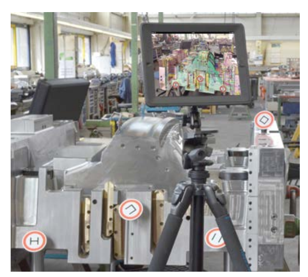
With the tablet's integrated camera, an overlay of the as-built object with virtual 3D data, including all process and workflow information, can be realized in real time.

time and location. It is also a cost-effective alternative to expensive augmented reality solutions. Usage is customizable, allowing for simple viewing options as well as more complex augmented reality scenarios. In addition, the modern data handling concepts, touch functionalities and context-related menu options make system control simple.