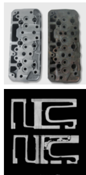
Comparison of new and old cylinder head