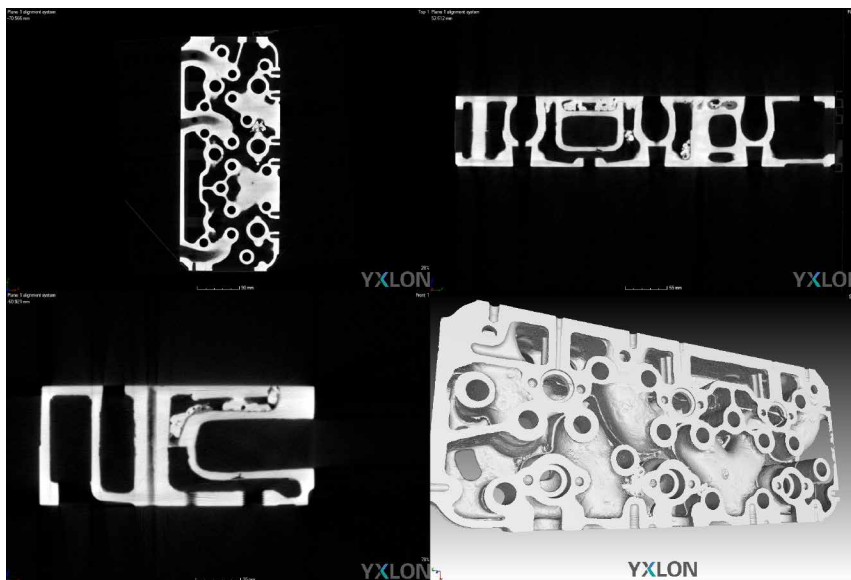
CT-Scan of a historical cylinder head to cast a new one after having reworked the data.

Reverse engineering is also very common to scan parts that physically interface with a new product and access to the digital 3D models from the CAD design is not accessible.