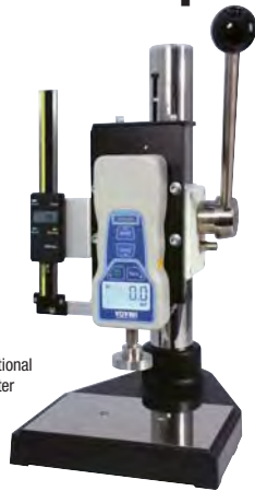
SVL-220-S with optional digital distance meter