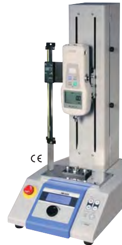
MX2-550-S with optional digital distance meter