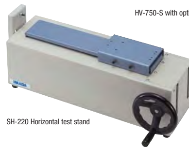
SH-220 Horizontal test stand

Appearance varies by model. Optional digital distance meter, add -S to the model number. *SVH-220 clearance 10.4"; SVH-220-L (long column) clearance 18.3"