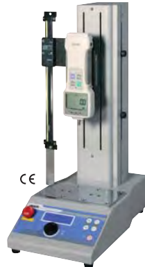
MX2-110-S with optional digital distance meter