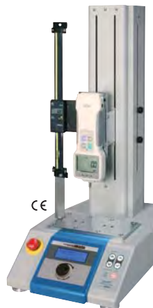
MX2-275-S with optional digital distance meter