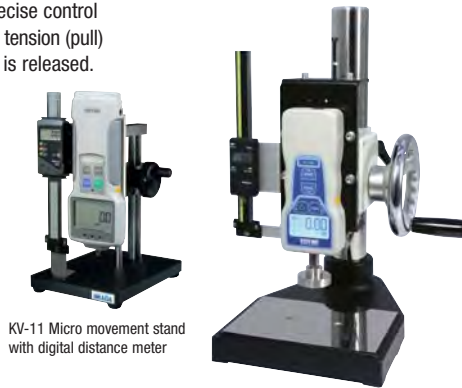
KV-11 Micro movement stand with digital distance meter