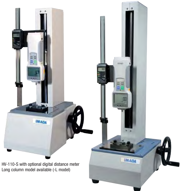
HV-110-S with optional digital distance meter Long column model available (-L model)